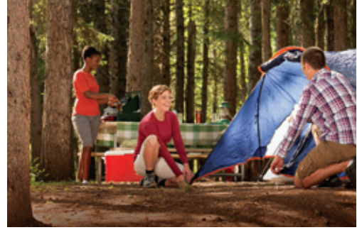
Prince Albert National Park