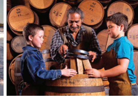
Fort Langley National Historic Site

Jasper and the majestic Rocky Mountains. Riding Mountain and its dramatic rise from the prairie landscape. Fathom Five and its fascinating marine life. The Fortifications of Québec and the impressive walls and ramparts that once protected the city. The Halifax Citadel and its breathtaking views of the harbour.