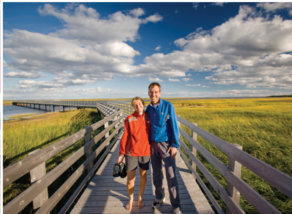
Kouchibouguac National Park