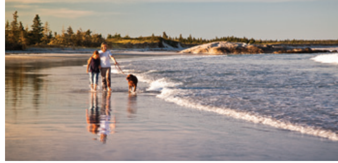
Kejimikujik National Park – Seaside