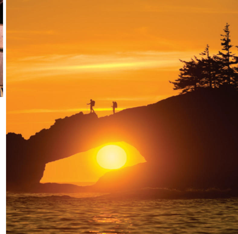
Pacific Rim National Park Reserve